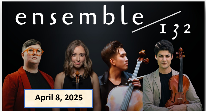
ensemble 132 April 8, 2025

ALL CONCERTS 7:30 PM - ST. JAMES LUTHERAN CHURCH 109 YORK STREET, GETTYSBURG, PA