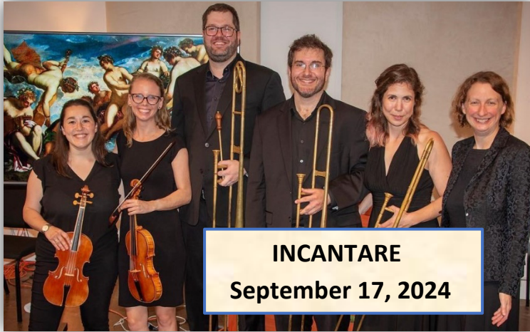
INCANTARE September 17, 2024